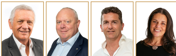
Directors From left to right: