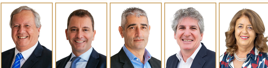
Directors From left to right: